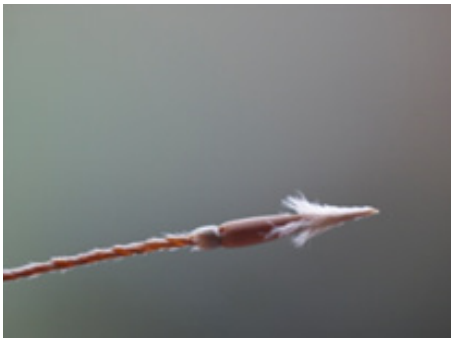
Chilean needle grass seed.