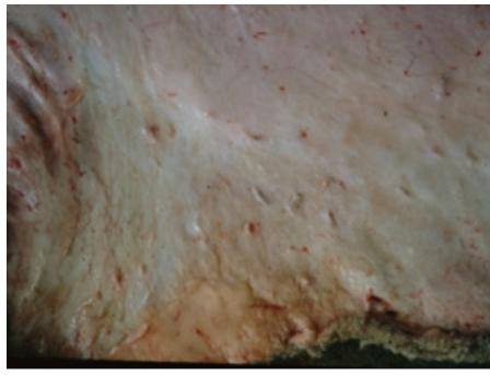
Seed-damaged sheep pelt.