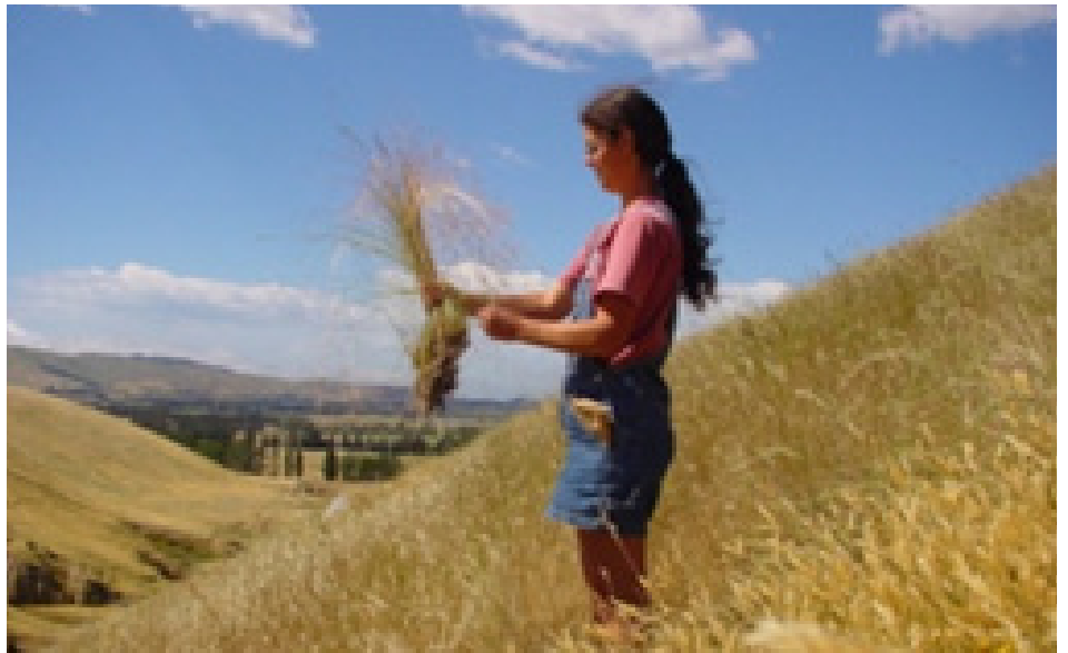
Nassella tussock in North Canterbury.