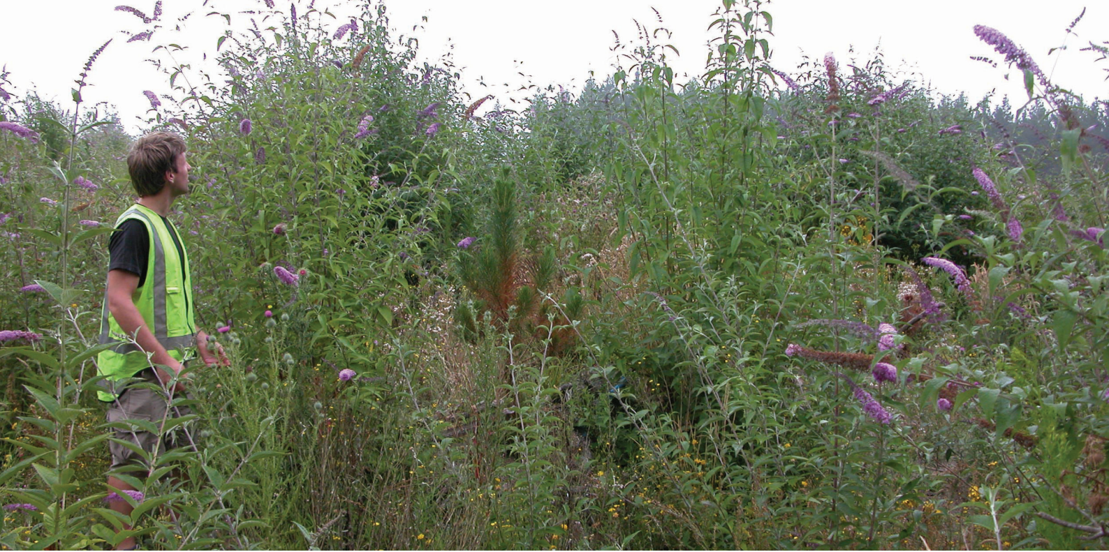
Buddleja outcompeting radiata pine in the Central North Island.