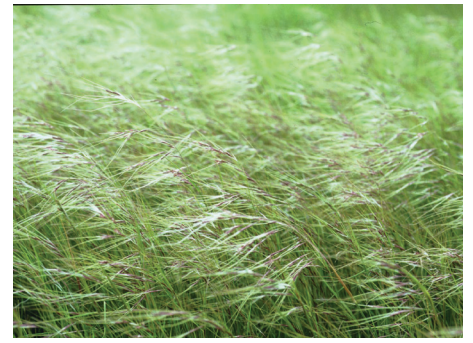
Chilean needle grass flowering.